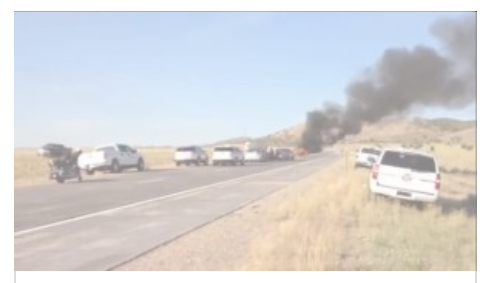
Raw Video: Car chase ends in flames